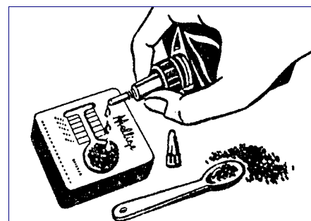
Adding indicator liquid to the sample